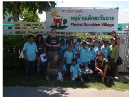
Group picture after English Camp

More photos can be seen on Facebook Projects Abroad Thailand - The Official Group