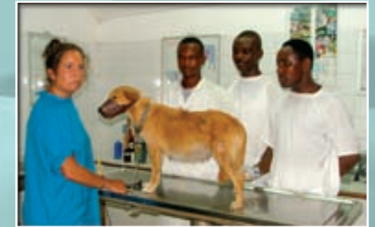
🏥 Veterinary in Ghana

Our animal care placement in Mexico is suitable for everyone. It is an extremely rewarding experience for all animal lovers. Based in Guadalajara we work in a busy animal hospital that cares for both domestic and wild animals that have been injured, mistreated or abandoned. Previous volunteers have witnessed some exotic and interesting animals pass